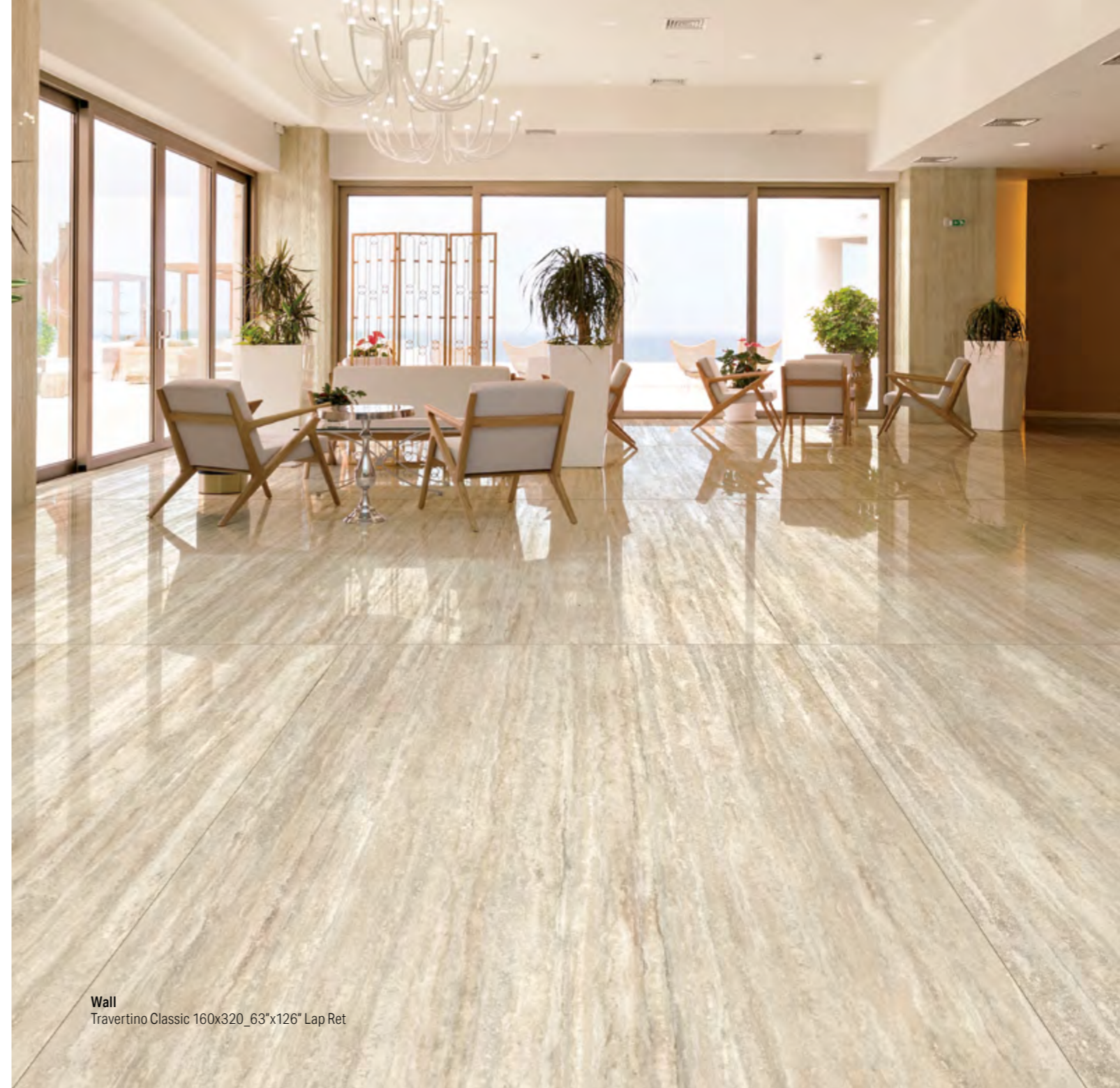
Wall Travertino Classic 160x320_63"x126" Lap Ret