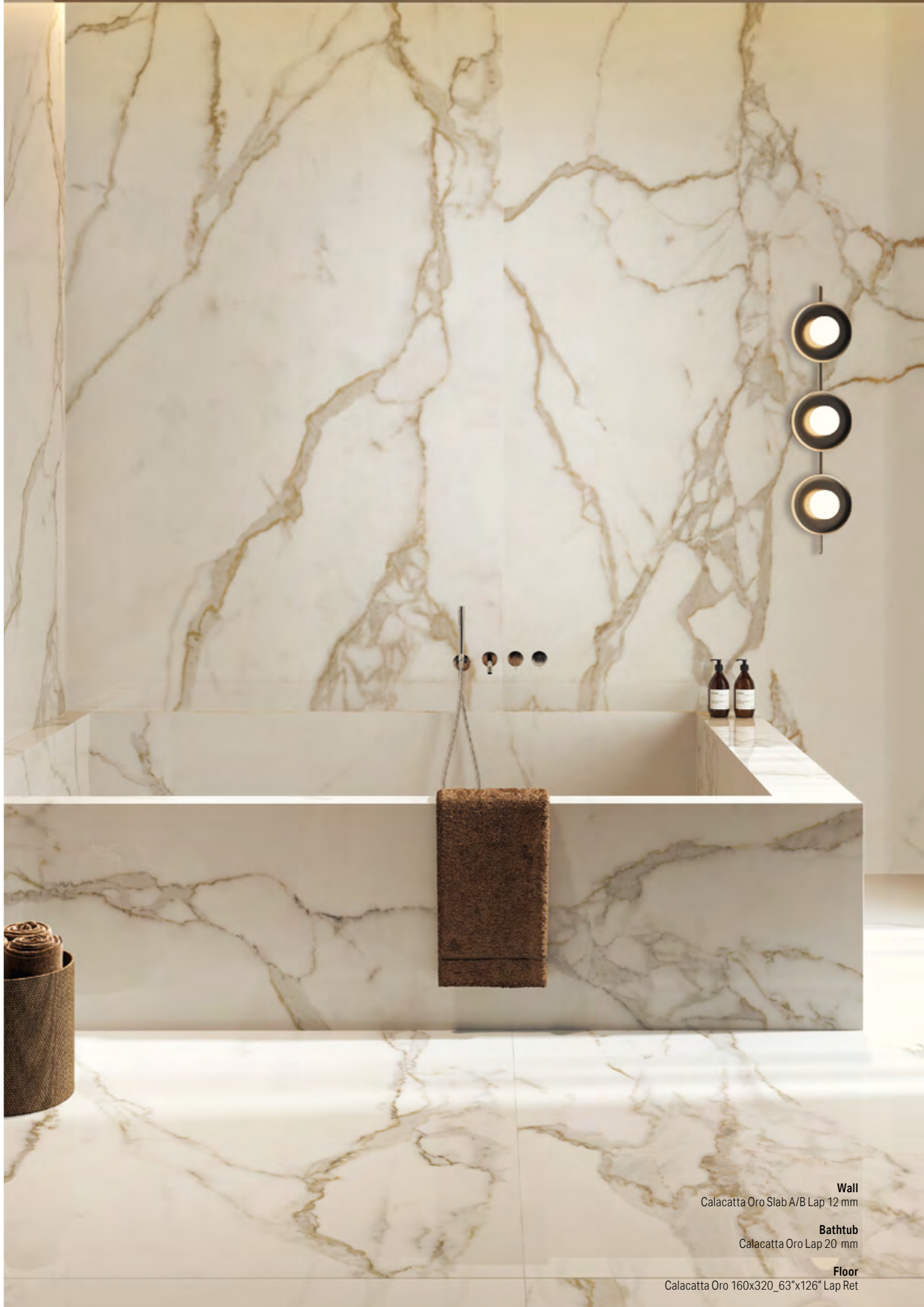
Wall Calacatta Oro Slab A/B Lap 12 mm