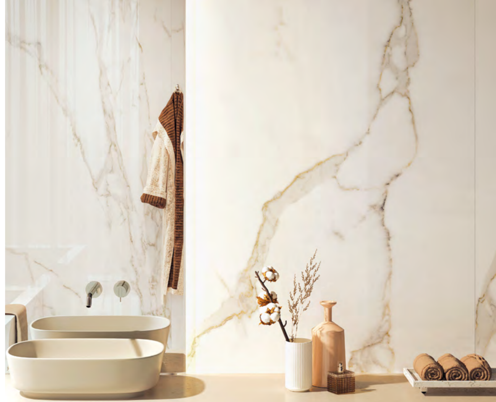
Wall Calacatta Oro 160x320_63"x126" Lap Ret